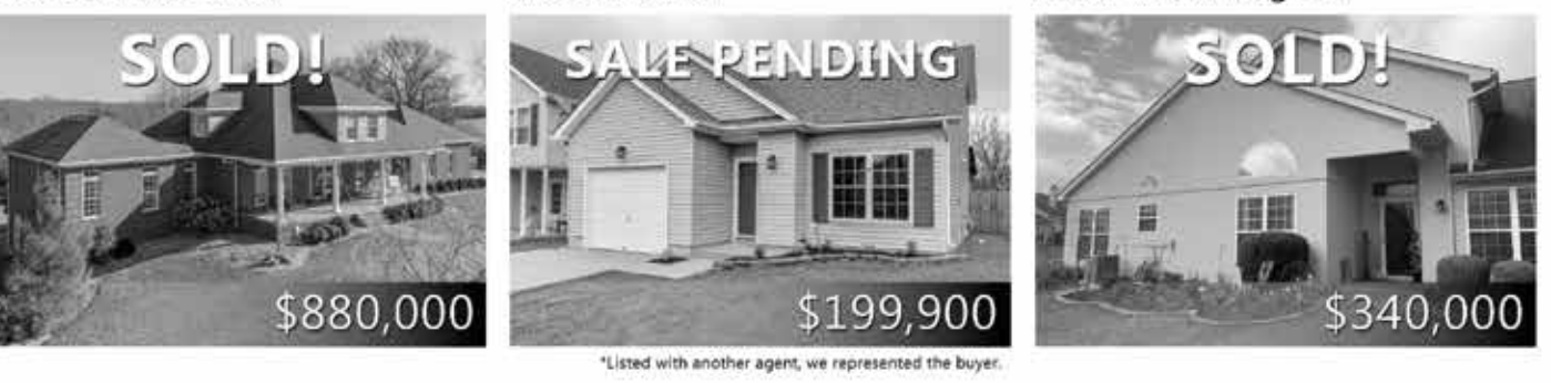
14027 Waters Edge Dr

BUYING or SELLING a home? Call 502-245-0525 for a FREE Home Evaluation