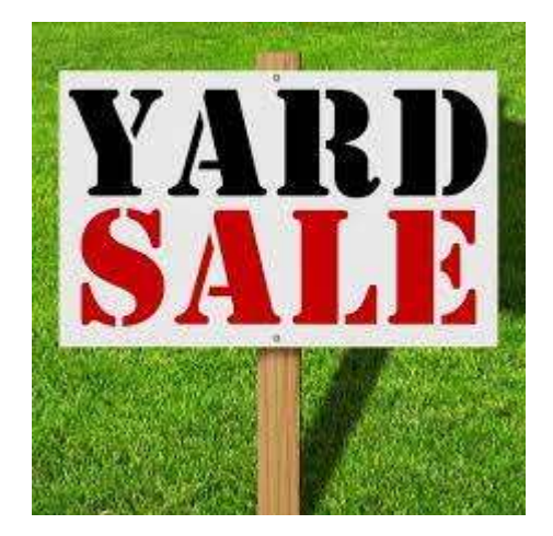
DOUGLASS HILLS YARD SALE WILL BE HELD ON FRIDAY JUNE 10TH AND SATURDAY JUNE 11TH