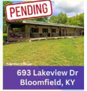
693 Lakeview Dr Bloomfield, KY