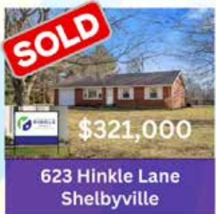
623 Hinkle Lane Shelbyville