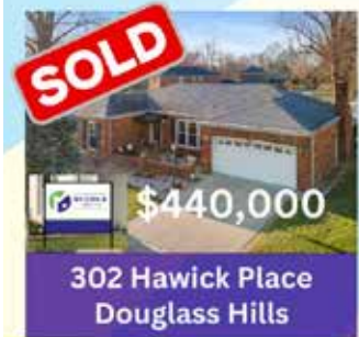
302 Hawick Place Douglass Hills