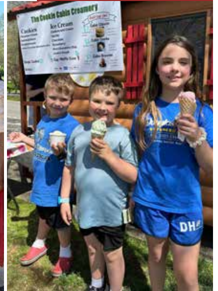
DOUGLASS HILLS CELEBRATED MAY WITH SHAKESPEARE IN THE PARK & EARTH DAY!