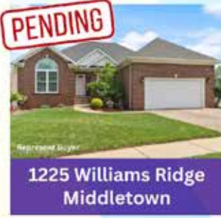
1225 Williams Ridge Middletown